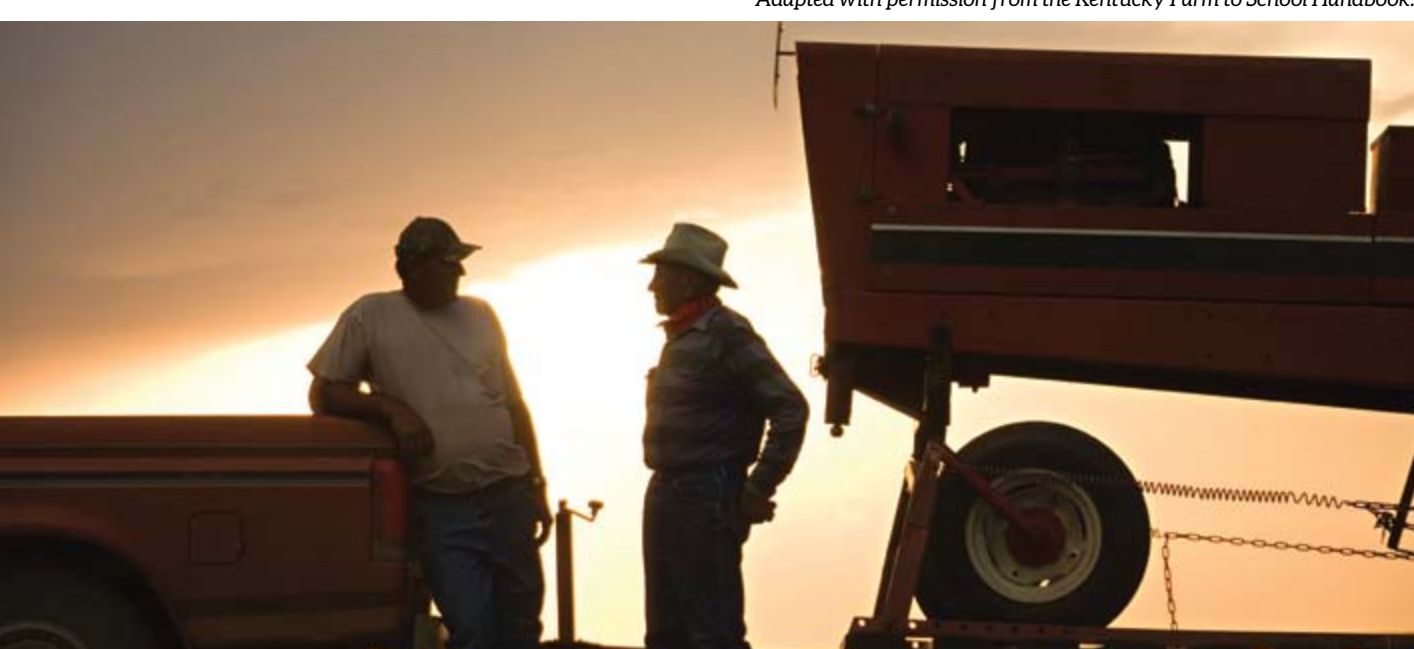
Adapted with permission from the Kentucky Farm to School Handbook.